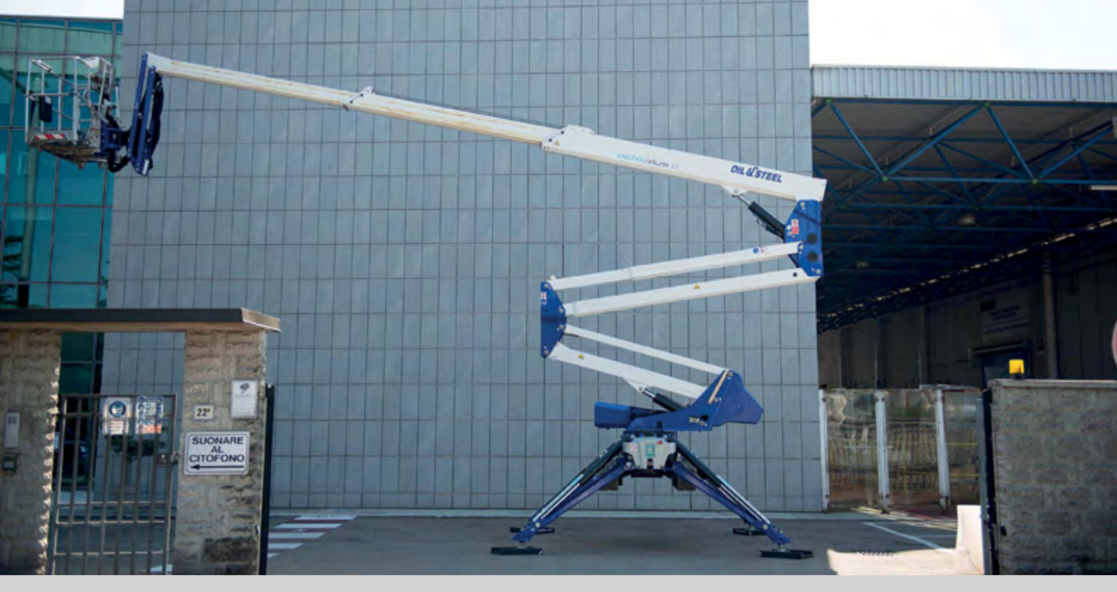
Exceptional ground clearance and a maximum working height of 21m - the Octoplus 21 delivers industry-leading performance