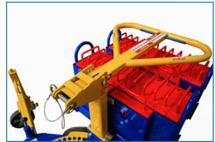
Safety interlock lever