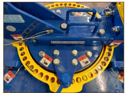
360° slewing ring