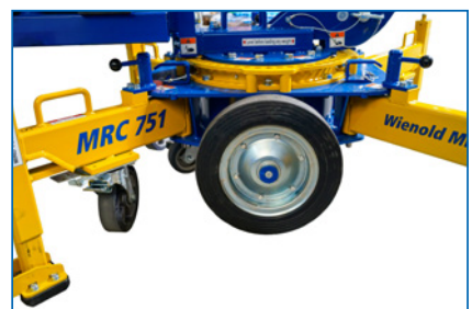
Large transport wheels