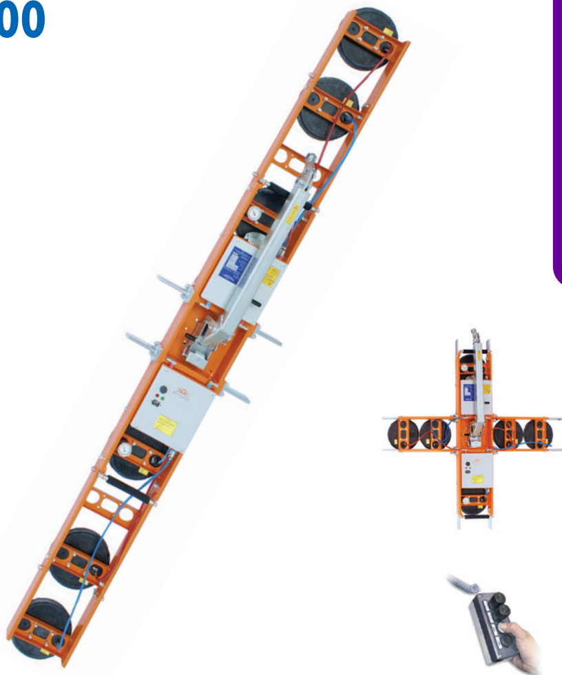
Wired remote control