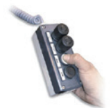
Wired remote control