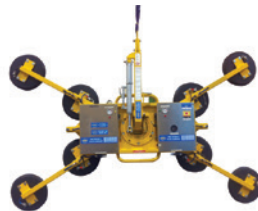
4 x extension arms with pads