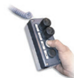
Wired remote control