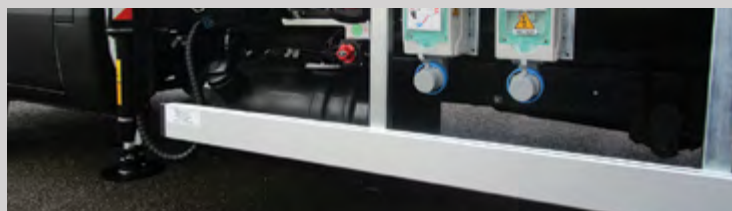
Available with under-run side protection