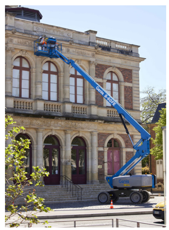
Low Noise, Low Emissions