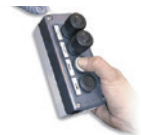
Wired remote control