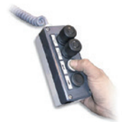
Wired Remote Control