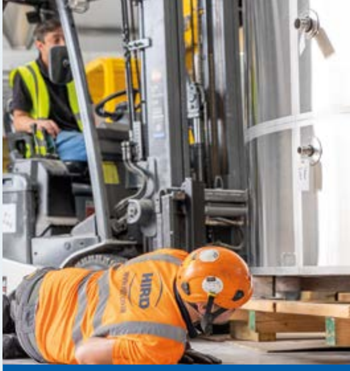
Health & Safety We offer full consultation, planning and risk assessment services