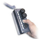
Wired remote control